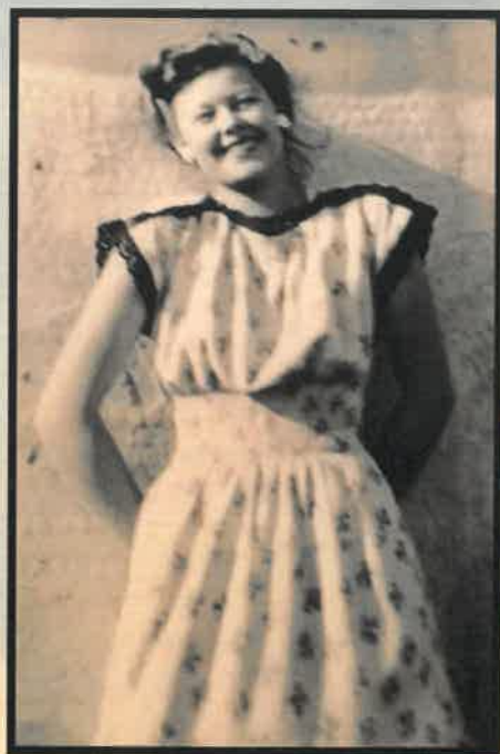
Williston, N. Dak., October 5, 1941