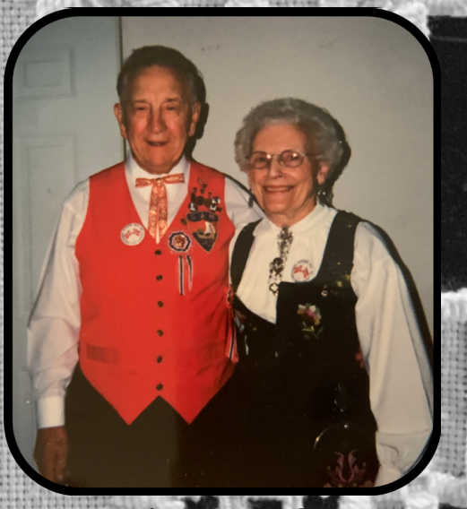
Arrangements By Fulkerson-Stevenson Funeral Home