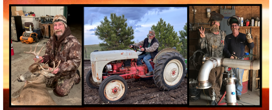
Arrangements By Fulkerson Stevenson Funeral Home ~ Sidney, Montana

Final Resting Place Sidney Cemetery ~ Sidney, Montana